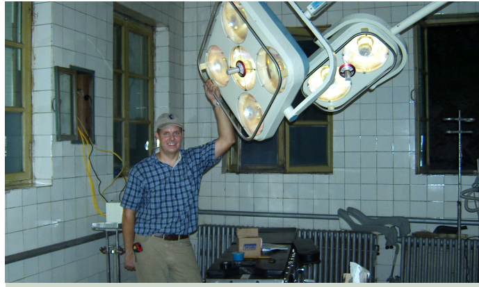
Newly installed operating room lights.

On the morning of the last day, the newly installed x-ray machine was still not functioning despite many hours spent trying to find the problem. Our team member overseeing the x-ray installation left for the hospital at 6AM to try to troubleshoot the problem (a miracle itself as schedule changes are almost never allowed). By now the confirming team had arrived in the city and this also being their last working day, they were scheduled to visit another nearby hospital for confirming activities first, and then visit the hospital where the technical team was madly working to try to finish up all the installations. By late morning the confirming team arrived at the hospital where our technical team was working. The plan was for them to visit the various areas of the hospital where all the equipment had been installed, deliver donor plaques for each room, take photos of the completed work, and then both teams were to head back to Pyongyang together. We were under clear instructions from our head guide not to dally.