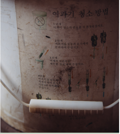
Water filter buckets supply safe drinking water to pharmacies, labs, patient room, homes and communities.