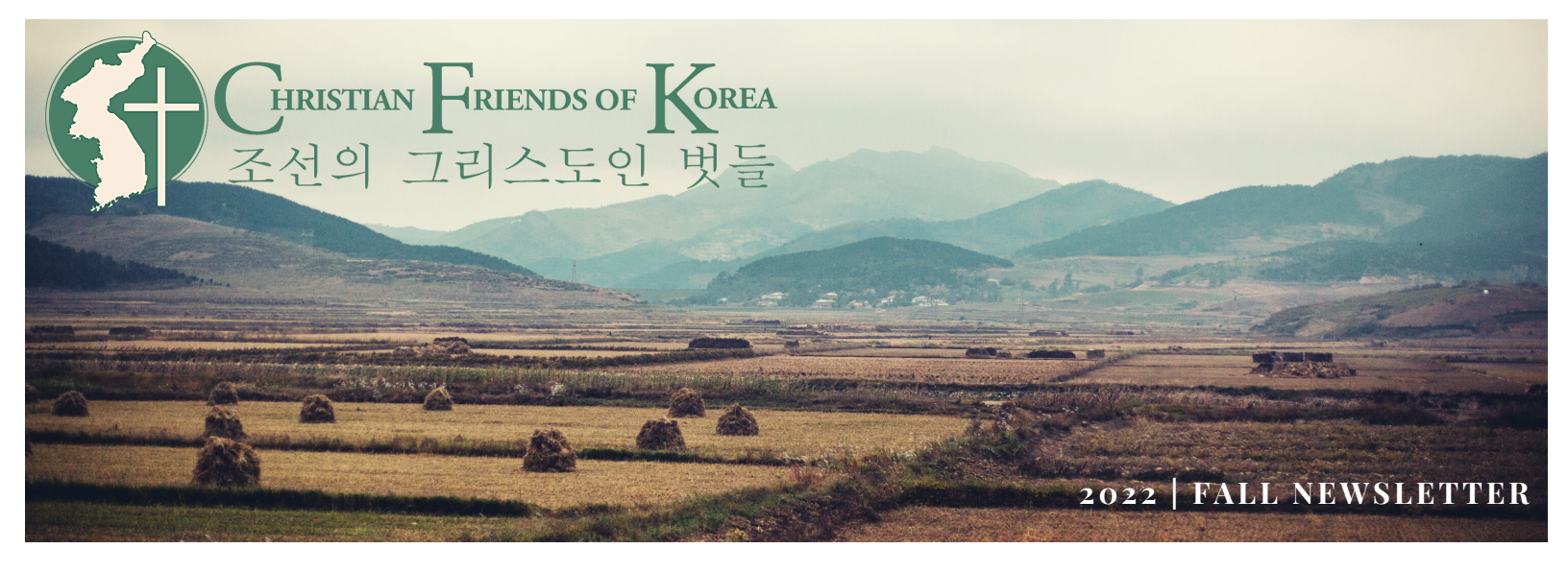
"Commit your way to the LORD; trust in Him, and He will act." -Psalm 37:5-