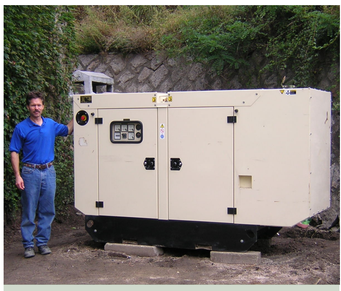
Newly installed generator.