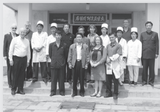
Combined CFK team

A typical trip to one of the hospitals or TB rest homes began with a convoy of vehicles traveling to the locations scheduled for the day. The road surface usually began with paved roads of varying quality, that soon gave way to a washboard gravel road, a muddy track snaking up into the hills, or even a rocky stream bed that had to be forded. Once we arrived, we were greeted by the director, doctors, nurses, and various local officials. We would be seated around a table with refreshments provided for the visitors (strawberries, peanuts, tea), introductions would be made, the donor list presented in Korean with