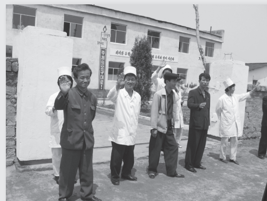
Warm farewell from rest home staff