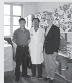
Discussions at TB rest home

an explanation, and Heidi would begin the process of inquiry. What is the current situation in this place? How did the devastating floods of 2007 affect the facility and patients? How many TB patients are there? What are your priorities here? Questions would be asked about the arrival of vitamins, health kits, bedding, laundry soap, doctor’s kits, hospital beds, medicine, and other things. Food shipments of canned meat, soy beans and dry vegetable soup mix were checked on. New equipment was sometimes delivered, including new microscopes. Some sites had cargo trimotorcycles to transport supplies slated for delivery. A new kind of greenhouse, which does not require an additional heat source even in frigid temperatures, was discussed and offered at each place. A tour of the facilities meant a chance to see delivered goods, meet the patients, to inquire about their health, and to offer best wishes and prayers for swift recovery. Outside, the greenhouses, which are so important for supplementing meager government rations, would be inspected. Walking tractors and bicycles provided by CFK were noted.