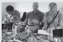
Confirming arrival of blankets and other goods at TB hospital