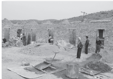
Construction of new patient ward at Hwangju TB Rest Home

They showed us two architectural drawings that they had completed, and gave us a list of all the materials needed for the job. After doing some preliminary figuring, we would expect our portion of the project to cost in the range of $35,000 - $50,000, and result in an entirely new facility to care for over 150 patients at a time. We hope to send roofing materials within the coming days so as to enable them to get the buildings under cover before the rainy season hits in July in full force. Then as we are able to raise further funds, we hope to send the balance of the materials needed to complete the project, hopefully by year end.