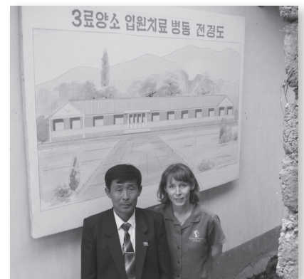
Vision for future of Hwangju TB Rest Home