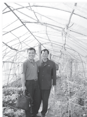
Fresh food grown in double-walled greenhouse

the government, nearly all other supplemental food (70-80% of their total need) was provided through CFK – either through fresh food grown in our greenhouses, or through direct food distributions such as canned meat, soybeans, and soup mix. They were especially grateful for shipments of food provided by Christian Aid Ministries and the Mennonite Central Committee – which have been particularly invaluable to them this year in caring for their patients.