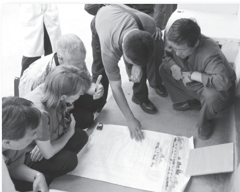
Architectural drawings for Hwangju TB Rest Home

NON-PROFIT ORG US POSTAGE PAID ASHEVILLE NC PERMIT #607