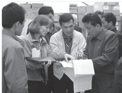
CFK team confirming distribution plans

Yet, while we are still warmly reflecting on our time spent with friends and colleagues who share a joint purpose, we are sobered and greatly alarmed by the 2nd ever-present theme that is the stark reality of North Korea – the overwhelming needs that we heard and saw. The overall situation currently in North Korea is extremely difficult for many. While our team was generously well fed and cared for, as we visited 14 of our rural rest homes and hospitals, we heard how vitally important our food contributions were to these TB care facilities, especially following the floods last year. Nearly every place quietly noted that while TB patients received priority rations (of rice) from