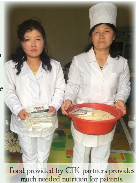
Food provided by CFK partners provides much needed nutrition for patients.

It is very clear that the food we are providing through partnerships with Christian Aid Ministries, the Mennonite Central Committee and Rise Against Hunger is critically important to these care centers. This food provides calories, vitamins, and protein needed by patients in their recovery. It is easy for the care centers to prepare this food for the patients, and the patients greatly benefit from food that is tasty, nutritious, and easy for them to digest. Directors reported that most patients gain 2-5 kg during their treatment thanks to the additional food and the availability of clean water. Some even gain as much as 10kg during their treatment.