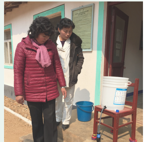
Staff being introduced to a water filter bucket at Jaeryong TB Rest Home.

We also had discussions with the Ministry of Public Health this time regarding the need for hepatitis testing of health care workers, and treatment or vaccination for them, as appropriate. Health care workers are at particular risk for contracting the disease in the hospital setting. We also discussed the need for a maternal child program to prevent the transmission of Hepatitis B from an infected mother to child during child birth. There is no shortage of good work to be done – just limited time and resources.