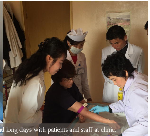
Together, CFK team members & North Korean doctors spend long days with patients and staff at clinic.