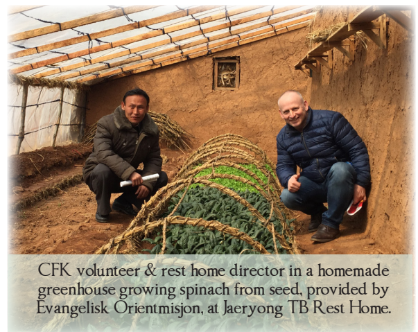
CFK volunteer & rest home director in a homemade greenhouse growing spinach from seed, provided by Evangelisk Orientmisjon, at Jaeryong TB Rest Home.

While we are grateful for any glimmer of good news, the current incidence rate in DPRK (641:100,000) remains among the highest in the world. If existing drug stocks are allowed to run out, these important gains can be quickly reversed and the disease could resurge again. We hope that international resources, including Global Fund, can be re-instituted such that all forms of TB can be brought under control. Care center directors also noted CFK's longstanding support to provide clean water, food, greenhouses and other needed supplies for TB patients and thanked us for the meaningful partnership that has contributed to this progress.