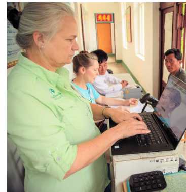
The breakdown of an automated chemistry analyzer required samples to be run one-by-one and entered manually into our database.