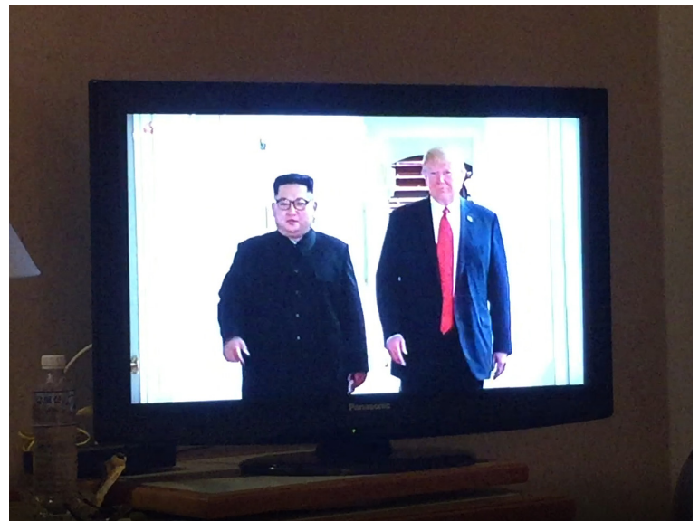
Footage of the summit meeting in Singapore was viewed on television by the team in the DPRK.

including many full color photographs and the full text of the signed declaration. This shift has been long awaited, and to see it unfold before us was truly unbelievable and miraculous from both our perspective and the North Korean perspective. On our drive this time from the hotel to the hospital, instead of being stopped every block by police officers for violating a civil defense drill, our CFK team members sang the doxology a capella out of thanksgiving for God's work on the Korean Peninsula.