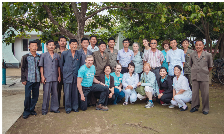
(Above) The CFK team and North Korean staff gather at Haeju #2 Hepatitis Hospital. (Below) During the first part of the trip, the CFK team worked to repair or enhance water systems at 8 locations.

During the first part of the visit, the team focused on mentoring activities at the National TB Reference Lab, repairing existing water systems at 8 locations, and collecting blood samples from more than a thousand hepatitis patients in Kaesong, Pyongyang, and, for the first time, in Haeju, the capital of South Hwanghae Province. These samples were then processed in the labs (in Pyongyang and Kaesong),