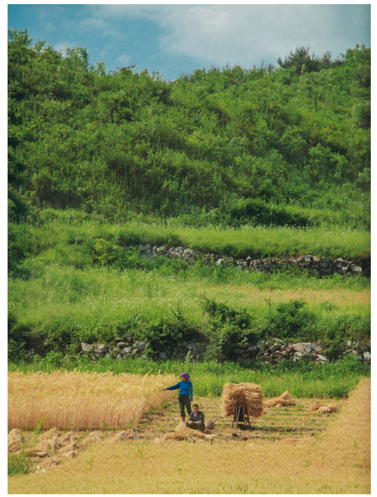
(Left) North Korean people were seen from the windows of the CFK team vehicles working in rice fields along the rural country roads. (Right) Golden barley being harvested in the countryside.

trees leafed out, and winter wheat and barley ripened from green to gold prior to harvest. Thankfully the rains have been plentiful this spring, and there is hope that this year will bring a better harvest.