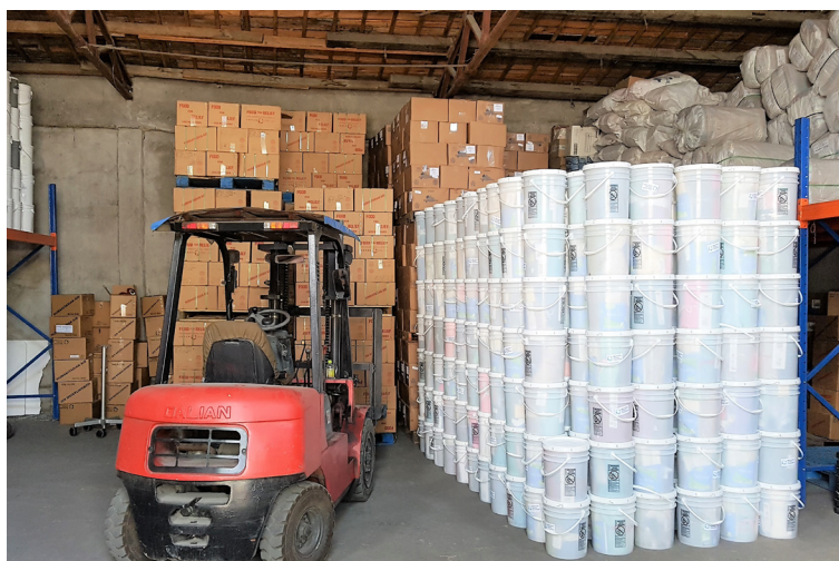
There are many items in the CFK warehouse ready for distribution to our supported facilities. Distribution will be confirmed in the fall.

name of Jesus Christ, to do our work in such a way that it brings Him honor, and to share His love despite heightened challenges and complex obstacles on many sides. Thank you for your faithful prayers and support that continue to sustain and grow the work of Christian Friends of Korea among tuberculosis and hepatitis patients and their communities. Together we are impacting many lives to the glory of God.