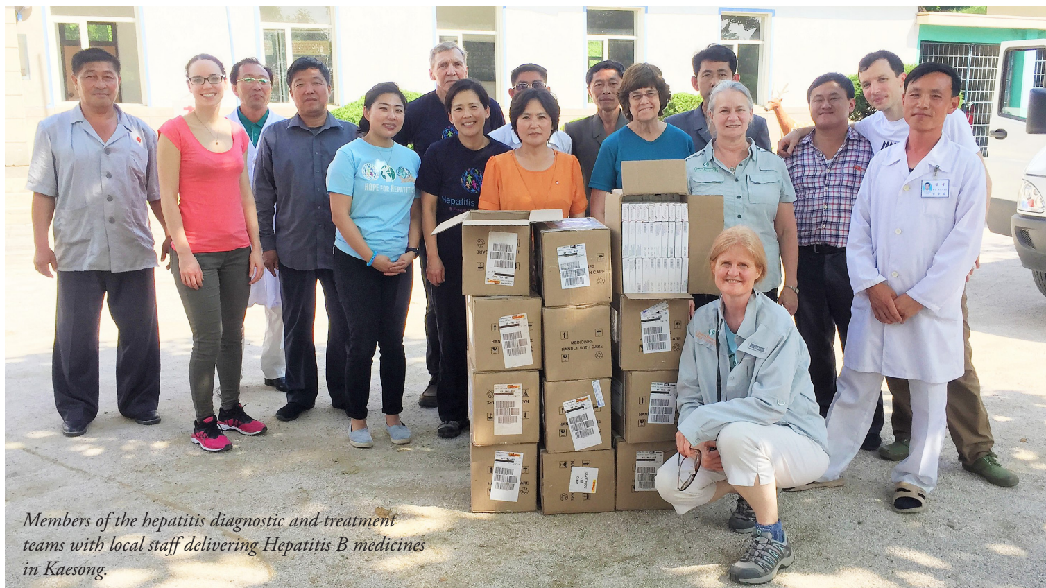
Members of the hepatitis diagnostic and treatment teams with local staff delivering Hepatitis B medicines in Kaesong.

“For the sake of his great name the LORD will not reject his people, because the LORD was pleased to make you his own...but be sure to fear the LORD and serve him faithfully with all your heart; consider what great things he has done for you.” 1 Samuel 12: 22, 24b.