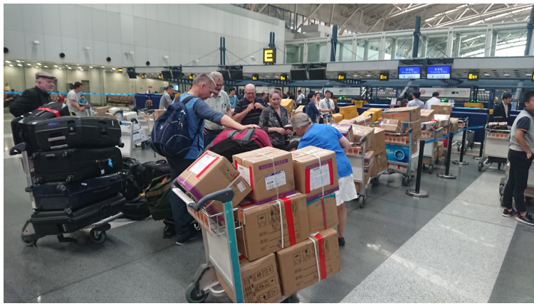
The CFK Team had to manage over 46 pieces of luggage in transit to the DPRK.

than our sacrifice. We were also reminded that He works in miraculous and unexpected ways as we wait on Him in faith and humility and seek His glory.