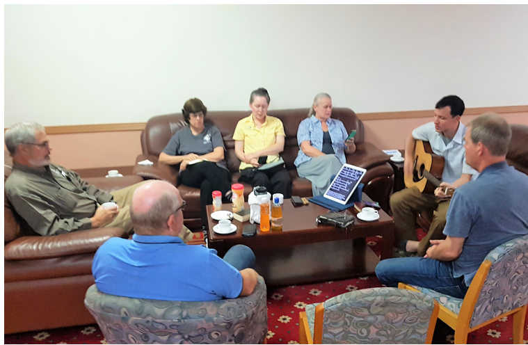
The CFK team worships at local North Korean churches on Sundays (left) and participates in daily devotions every morning (right).